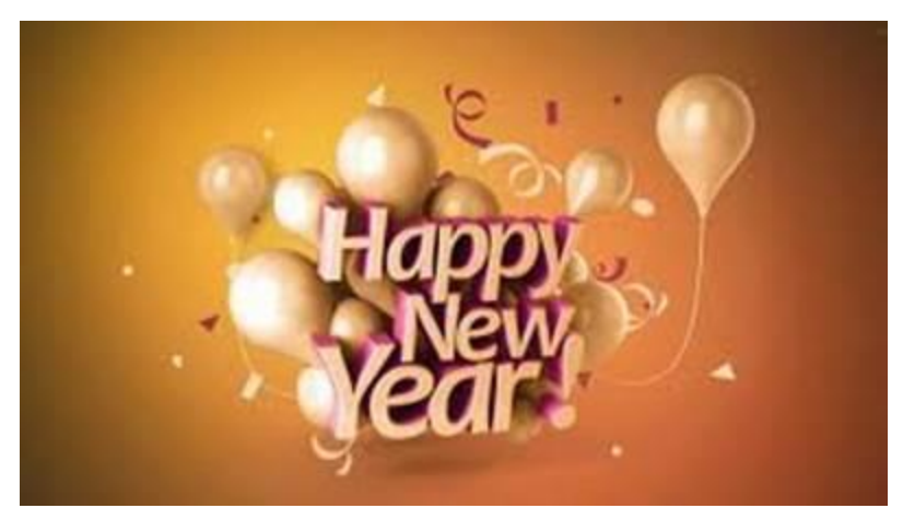
from your friends at Academy of International Business (AIB)-U.S. Midwest Chapter