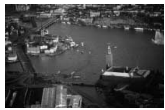
Aerial view of Stockholm

I am sure that you will all by know that the AIB Executive Board members have taken the decision to move the AIB meeting 2004 from Istanbul to Stockholm. This was an extremely difficult decision which was taken after a great deal of consideration, debate and heart searching. All the arguments for keeping the