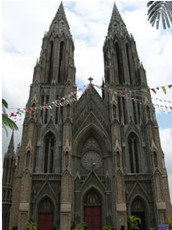
St Philomena's Church.

After lunch, drive to Srirangapatna (visit the tomb of Tipu Sultan and the magnificent 11th century Ranganathaswami temple). Continue journey to Bangalore.